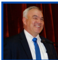
JUSTIN PRICE REP, DISTRICT 39